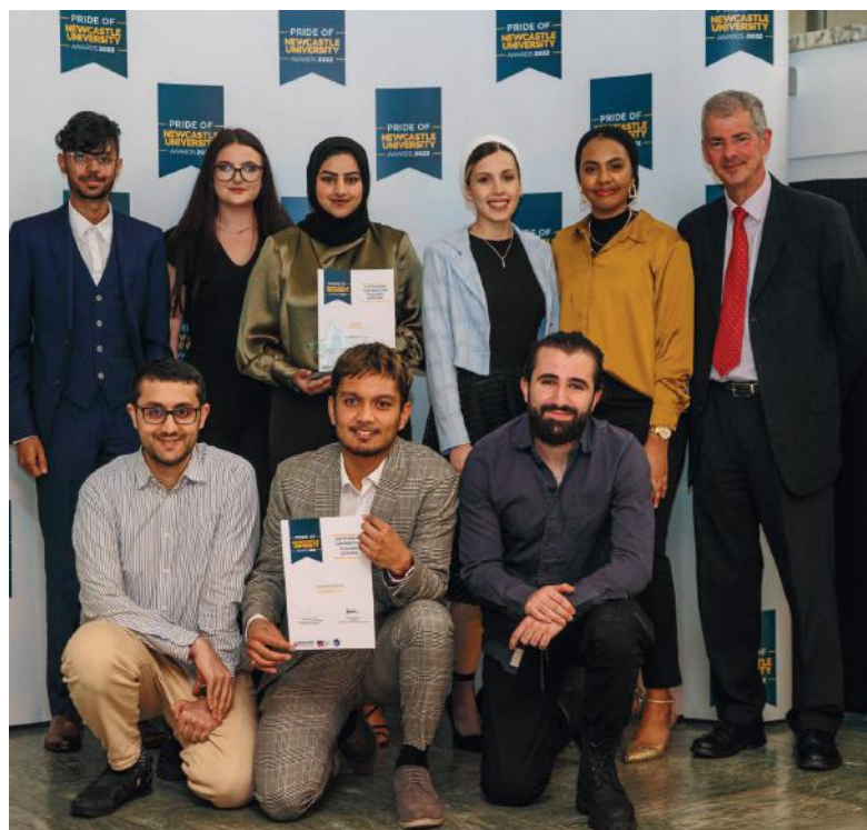
The Pride of Newcastle University Awards recognise our students' outstanding contributions through extra-curricular activity.

With Newcastle-based charity Street Paws, which provides free, accessible vet care and support services to homeless people and their pets across the UK, our students carried out research to identify and better understand the issues that restrict homeless pet owners from being able to access hostels and other accommodation. Another group worked with Wearside Women in Need (WWiN), which provides accessible community-based services to women and children at risk of or experiencing abuse. The project looked at the implications of unregulated refuges for families escaping domestic violence, uncovering some stark findings that are of wide concern in the Housing Sector.