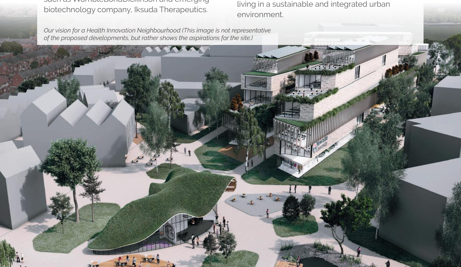
Our vision for a Health Innovation Neighbourhood (This image is not representative of the proposed developments, but rather shows the aspirations for the site.)

Based on the success of Helix, we are leading the development of the UK's first Health Innovation Neighbourhood, on the site of the former General Hospital in Newcastle's West End. Building on more than 20 years of investment and world-leading research, it will bring together leading academics, industry, public sector organisations and local communities to create a global exemplar for healthy ageing, enabling people to live better, longer, healthier lives. Combining research, lifelong learning, a sense of community and sustainable placemaking, the new neighbourhood will provide inter-generational living in a sustainable and integrated urban environment.